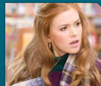
Confessions of a Shopaholic Premieres Dec 12