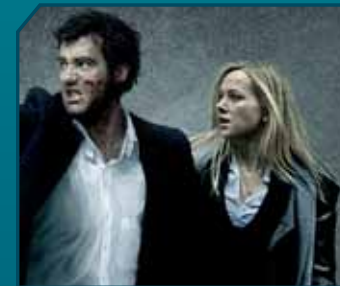
The International Premieres Nov 28