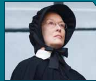
Doubt Premieres Nov 21