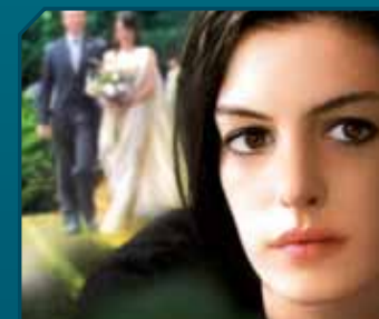
Rachel Getting Married Premieres Dec 19