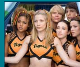
Fired Up Premieres Nov 14