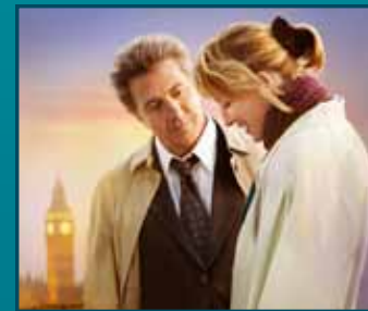
Last Chance Harvey Premieres Nov 7